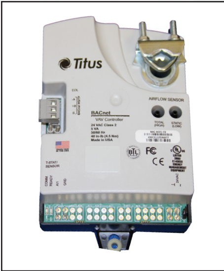
SINGLE DUCT COOLING ONLY