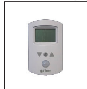
DIGITAL DISPLAY W/OCCUPANCY SENSOR