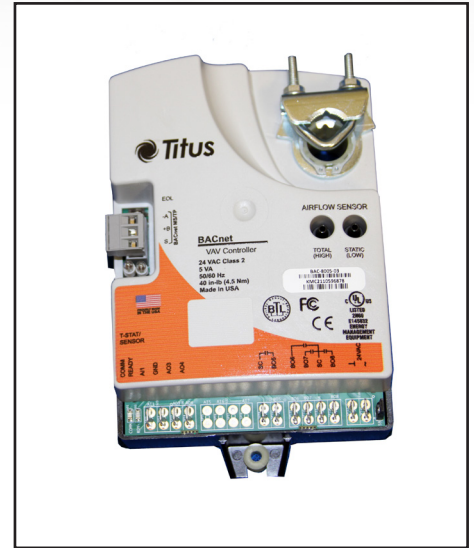
DUAL DUCT MIXING & NON-MIXING