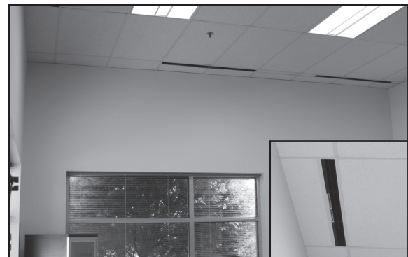
Below: EOS Primary-Secondary (DR) configuration installed in an office environment along the perimeter