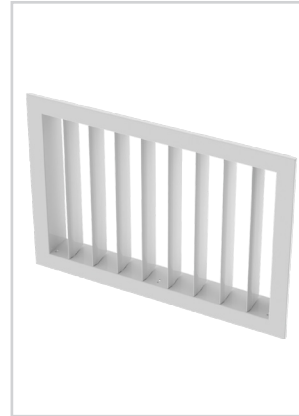
121 (RL / RS)