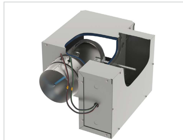
Cutaway view of the components for the ESV terminal unit