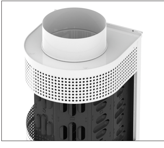
Cutaway of DVHC Diffuser

The DVHC is a semi-circular displacement diffuser with a 180 degree air discharge pattern. Utilizing the enhanced pattern controllers, it can supply a large volume of air at low velocity into the occupied zone. This model can contribute toward achieving LEED EA Credit 1: Optimize Energy Performance; IEQc2: Increased Ventilation; and IEQc7.1: Thermal Comfort - Design.