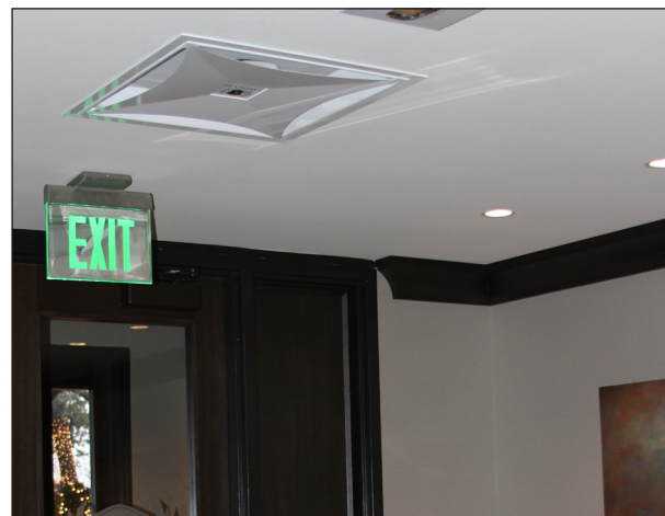
Spectrum diffuser with logo inset installed in an upscale country club

The Spectrum applique is constructed of matte substrate material with adhesive backing. Each appliqué is individually die cut for consistency and fitted to the pre-formed square embossment in the center of the Spectrum faceplate after the diffuser is painted. Appliqué specifications