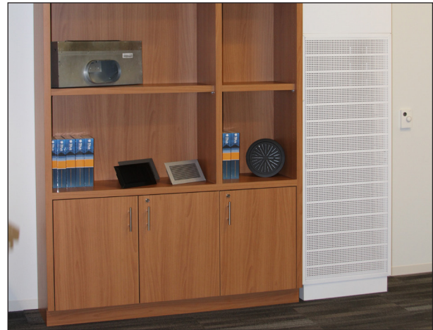
DVR3 unit installed along the wall next to a bookshelf with duct cover and mounting base