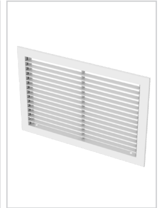
350 (ZFL / ZFS)