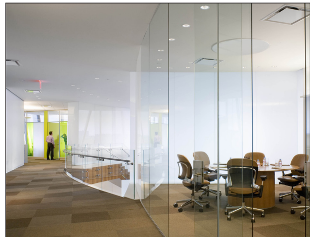
TJD diffuser installed in the ceiling of a low load space