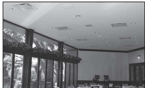
OMNI diffusers installed in the ceiling of a country club