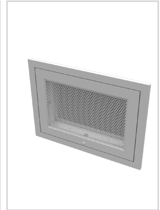
8FF / 8RF