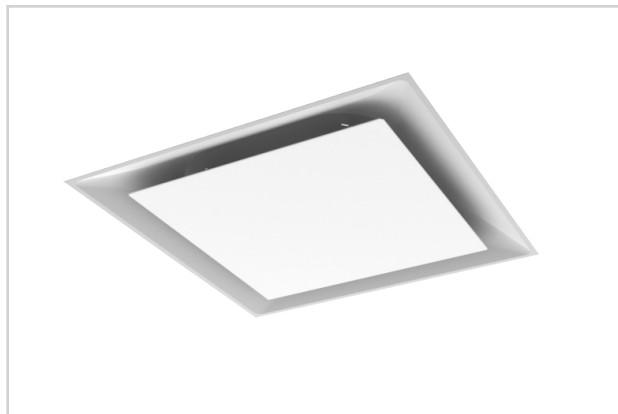
OMNI / OMNI-AA