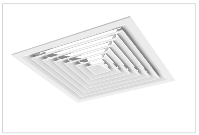
TDC / TDCA

For a uniform face appearance on all neck sizes, specify an 18 x 18" dimension A size and the desired round neck size. This is available in 24 x 24" lay-in module size only.